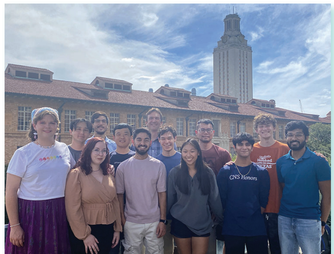
The Keatinge-Clay Lab at The University of Texas at Austin

Within diverse microbes, the DNA-encoding modules assemble into gene clusters that produce synthases that biosynthesize a diverse range of compounds used for medicinal, agricultural, and industrial purposes (e.g., the antibiotic erythromycin). In fact, polyketides represent approximately 20% of the top-selling drugs. Because polyketides are often used by microbes as chemical weapons against other microbes, they are a good source of bio-active molecules.